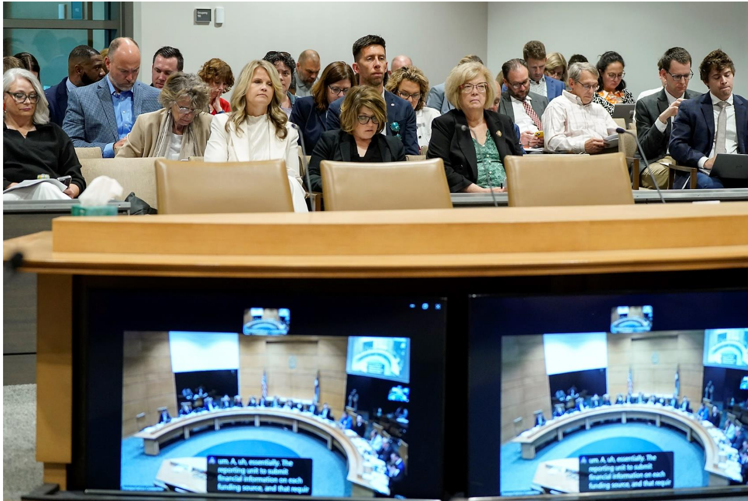
County Commissioners, county staff, and other transportation stakeholders attend the Friday, June 6 Transportation Working Group meeting.