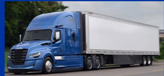
Freightliner 5-axle Semi