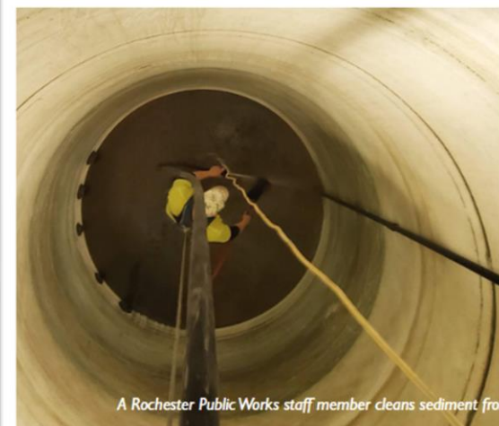
A Rochester Public Works staff member cleans sediment from